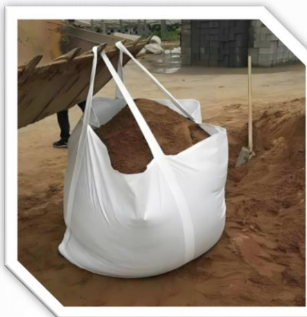
construction industry FIBC bulk bags