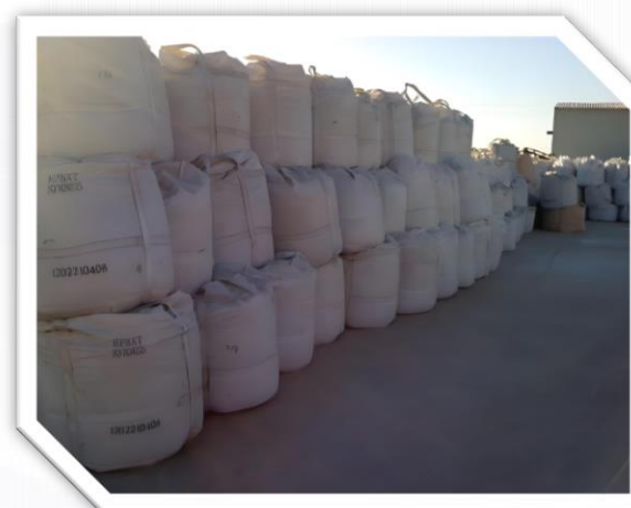
Mining industry FIBC bulk bags