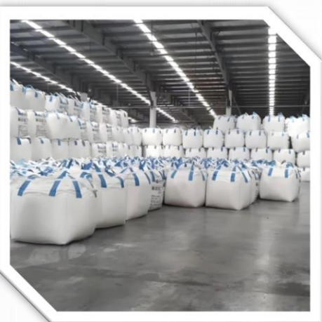
Logistics and warehousing FIBC bulk bags