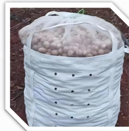
Food industry FIBC bulk bags