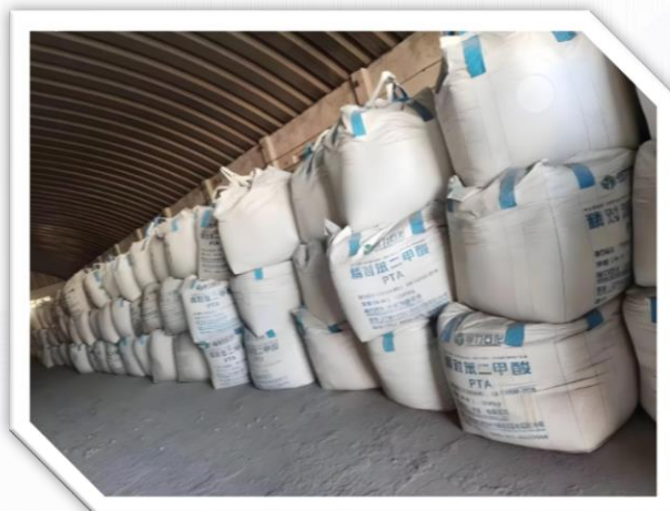
Chemical industry FIBC bulk bags